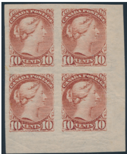
Lot 180 Realized $3,276