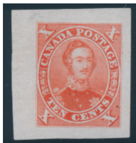
Lot 78 Realized $5,382

154 $275 155 $550 156 $675 157 $1,200 158 $650 159 $550 160 $4,200 161 $325 162 $450 163 $120 164 $170 165 $80 166 $60 167 $200 168 $550 169 $600 170 $225 171 $425 172 $70 173 $375 174 $200 175 $225 176 $725 177 $190 178 $225 179 $375 180 $2,800 181 $8,500 182 $7,500 183 $5,000 184 $1,350 185 $2,800 186 $1,150 187 $225 188 $90 189 $650 190 $400 191 $900 192 $900 193 $475 194 $20 195 $275 196 $425 197 $300 198 $575 199 $500 200 $775 201 $575 202 $375 203 $400 218 $3,200 219 $900 220 $425 221 $1,150 222 $1,150 223 $1,350