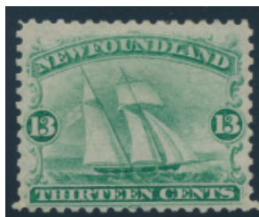
Lot 423 Realized $555