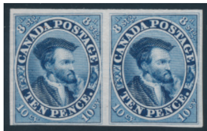
Lot 39 Realized $1,111