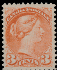
Lot 158 Realized $760