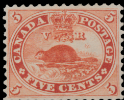
Lot 76 Realized $2,574