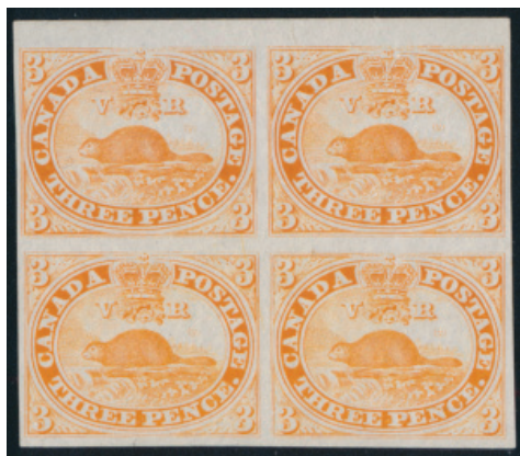
Lot 13 Realized $1,696