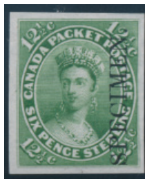
Lot 94 Realized $906