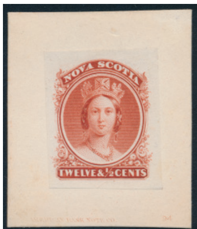
Lot 375 Realized $1,989