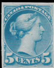
Lot 160 Realized $4,914