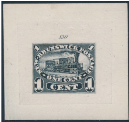
Lot 295 Realized $994