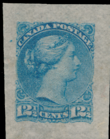
Lot 181 Realized $9,945