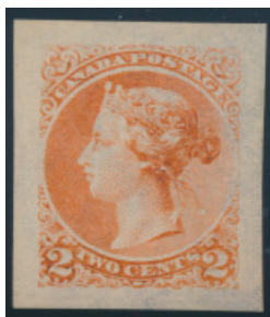
Lot 152 Realized $1,228