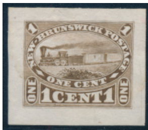
Lot 294 Realized $848