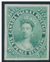
Lot 61 Realized $643