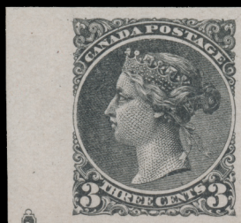
Lot 155 Realized $643