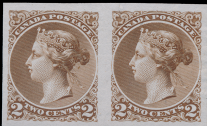
Lot 147 Realized $906