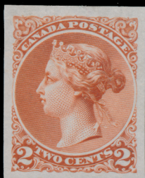
Lot 151 Realized $702