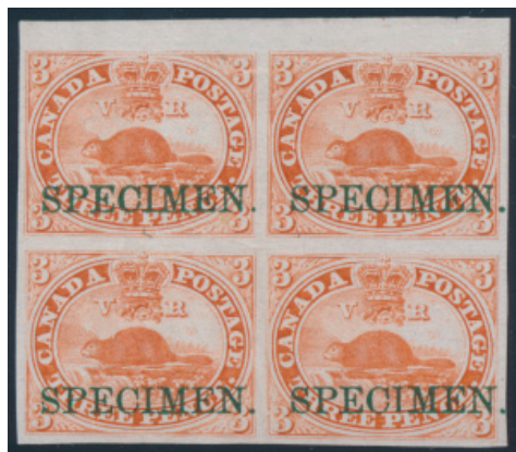
Lot 10 Realized $1,696