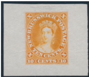
Lot 302 Realized $760