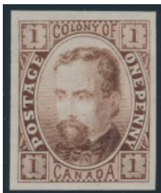
Lot 6 Realized $877