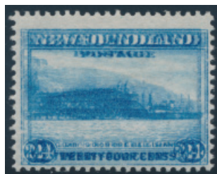
Lot 466 Realized $1,228