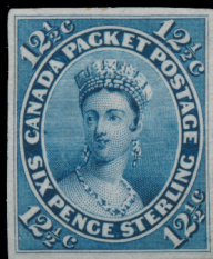
Lot 89 Realized $1,462