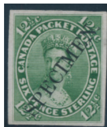
Lot 95 Realized $819