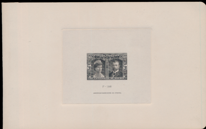
Lot 218 Realized $3,744