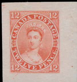
Lot 29 Realized $12,870